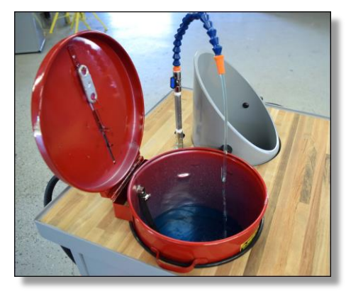
MiJET Wash Station