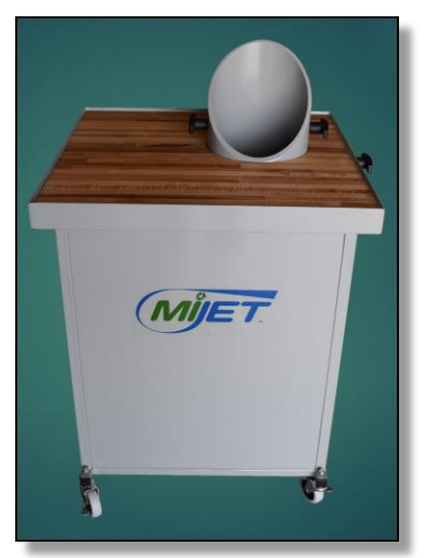
Models 15-12-DEL and 15-08-DEL